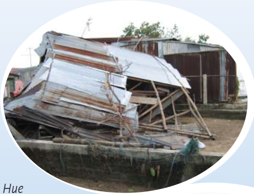
Homes in Hue (top) and Hoi An (bottom) were demolished by the high winds.

Rebuilding has already started for some families in Hue.