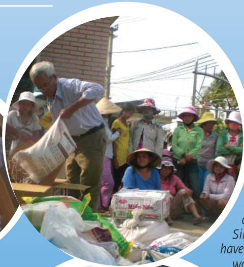
There were many hungry families who were yet to receive any outside help. Families in Hue rely on fishing as their livelihood. Since the storm, they have been unable to work or bring home food. The rice and noodles you sent put a smile on their faces!