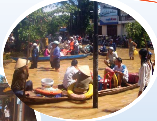
(Left) Staff & a volunteer take supplies to the kids in the Blue Dragon Home. (Right) Boat was the best form of transport through the streets of Hoi An. In Hoi An, a dam wall burst, causing a flash flood to sweep Hoi An Town. These photos were taken days after the water had receded a bit.