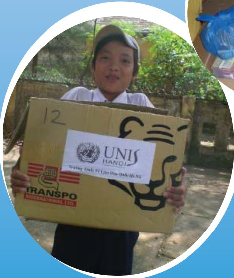
In Hoi An, (above) supplies were re-packed and distributed to the families of the children in our Home, as well as to families supported by two other local charities.